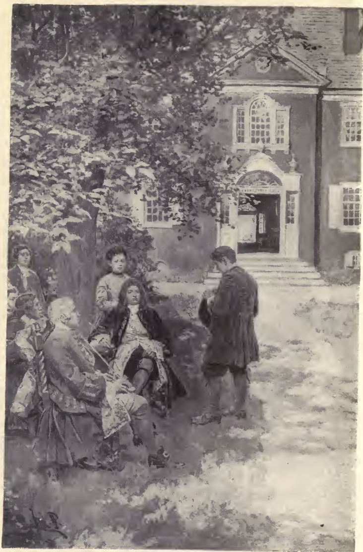
“SPEAK UP, BOY, SPEAK UP,” SAID THE GENTLEMAN.” (SEE PAGE 90.)